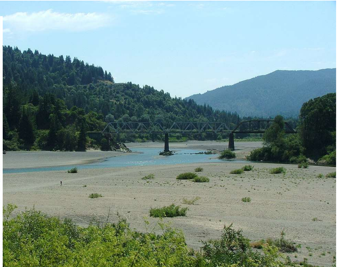
Eel River, Mendocino County